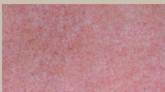
NEW 97-SEPRU RUSTIC FLESH

Can be used with the septum tool or simply make one cut down the center of the manikin's nose, cut a piece off of the septum sheet and fold it together tightly (this will make both sides from one piece instead of inserting two separate pieces), place the folded end in first, trim off any excess. Now cut two pieces from the protective cover sheet and place in front of the septum sheet on each side, trim off any excess. Fill the cut back in with bondo or apoxie sculpt. The protective cover sheet can be cleaned with lacquer thinner or Windex if any over spray gets on it while finishing your mount.